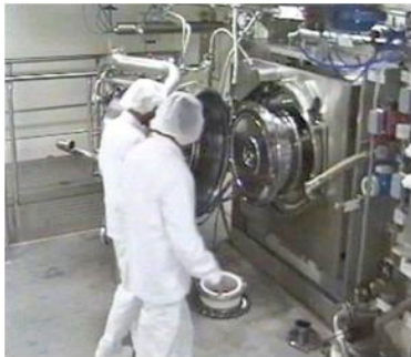
Fully inspectable process chamber