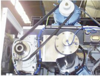
Electro/mechanical filter cloth inversion system