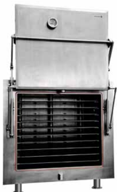
Fixed shelves version with automatic door opening system

With a wide front flange and the set-back supporting systems, through the wall installation is possible, further isolating the clean room from the technical area.