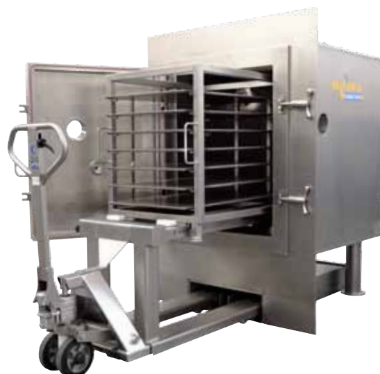
Extractable shelves version

The plate pack is removed with the aid of an external hydraulic trolley, completely made of stainless steel and equipped with antistatic polymer wheels. With this trolley the operator can quickly handle the plate pack in extreme safety and without any difficulty. In addition, by using an external hydraulic trolley, no rails or wheels are needed inside the cabinet, that would make cleaning and swab testing really difficult, complying with ATEX directives and cGMP standards.