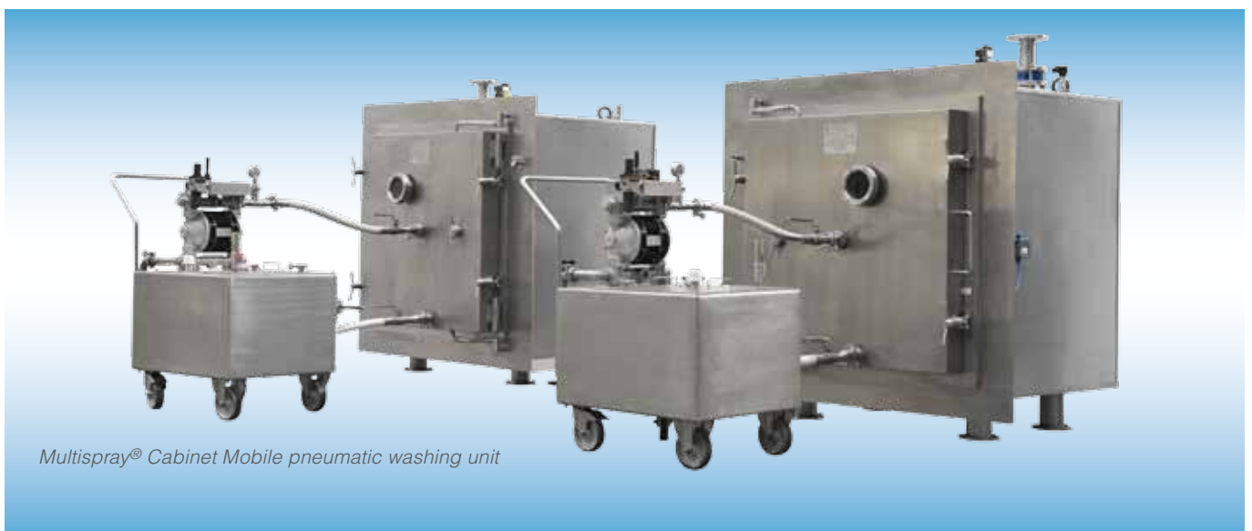
Multispray® Cabinet Mobile pneumatic washing unit